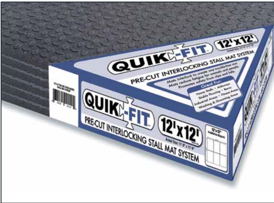
MATS INTERLOCK TO FORM FULL-SIZED STALL KIT