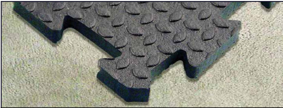
CLOSEUP OF TOP PATTERN PUNTER™