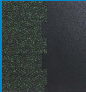
Close up of Emerald with contrast black

In 3/4" thickness: 3' x 4' centers (not shown) 2' x 3' borders (not shown) 2' x 4' borders 2' x 2' corners with Beveled or Non-Beveled outside edge!