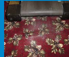
Left: carpet fibers and dust without mat. Right: with mat, less dust and fibers.